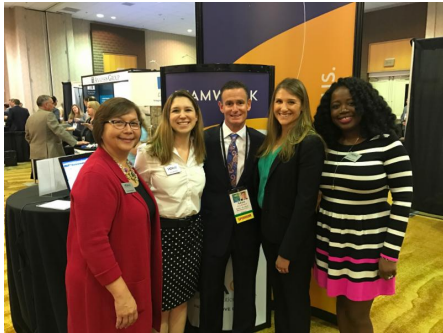
At HDA Meeting

Learn More About WDSrx - The Logistics Pipeline For The Pharmaceutical Supply Chain