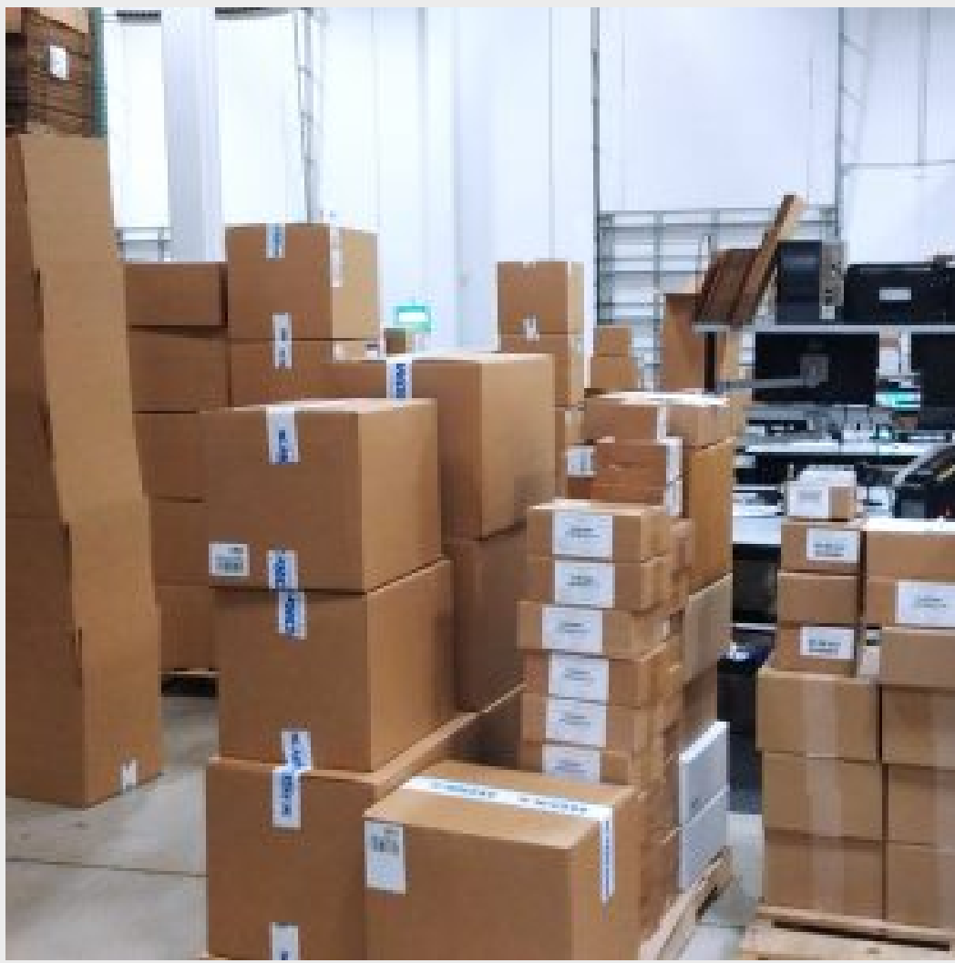
Orders at WDSrx in Boca Raton, FL are packed into boxes in advance of approaching Hurricane Irma on September 7, 2017