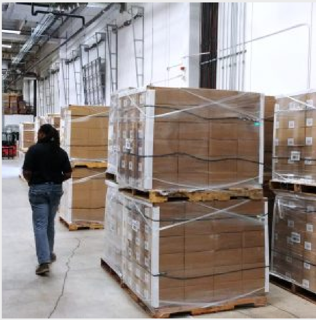
Exactly 224,000 units are prepared for transport from WDSrx in Boca Raton, FL to their Sugar Land, TX facility in advance of Hurricane Irma